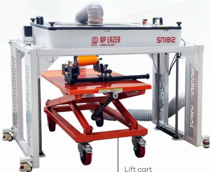
Lift cart included