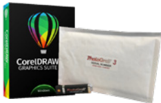
Photo Processing Software

Engrave cylindrical objects like wine bottles, stainless mugs, glasses, flashlights and more.