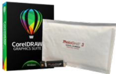
Photo Processing Software

Engrave cylindrical objects like wine bottles, stainless mugs, glasses, flashlights and more.