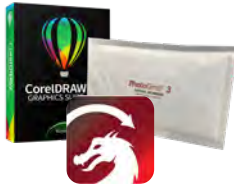
Photo Processing Software

Engrave cylindrical objects like wine bottles, stainless mugs, glasses, flashlights and more.