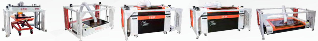
SN1812LR SN2616LR SN2816LR SN4024LR SN4836LR